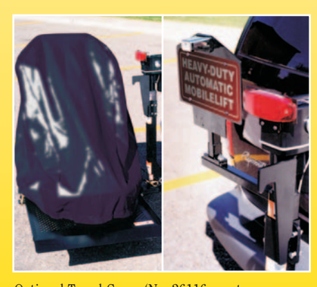
Optional Travel Cover (No. 26116 scooter cover and No. 26117 wheelchair cover) and License Plate Bracket (No. 25955) are available.