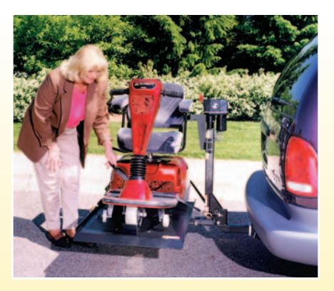
Once your scooter is on the platform and the brake is locked, push the switch to raise and stop halfway. Attach the adjustable safety belts. Finish raising until the Mobile-Lift automatically locks into place. Then just drive away!