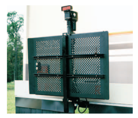
The Mobile-Lift Outside Model folds up out of the way when not in use. Just unfasten the lock-up strap and lower platform when ready to use.