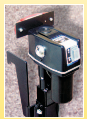
Hi-Torque Acme Actuator with an easy-to-operate switch, brake light, and built-in night lights. Emergency crank-through handle allows operation even when the battery fails.

It comes complete with simple wiring and installation instructions, owner's manual, and one-year limited factory warranty. Attractive waterproof covers for the Mobile-Lift are also available.